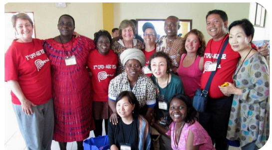
CFOI folks from East Africa, West Africa, South Pacific, North America and East Asia at dinner in Peru